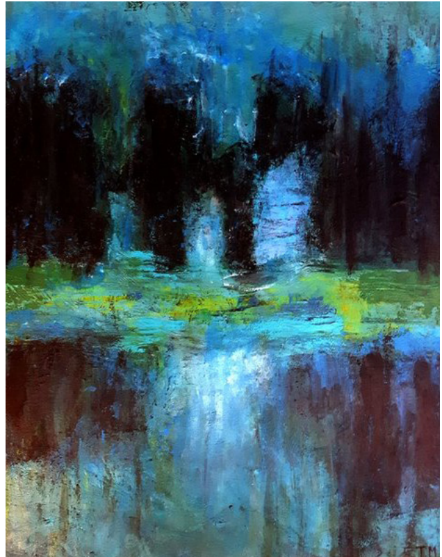
Night Bridge Tom Mackie, PotteryWorks